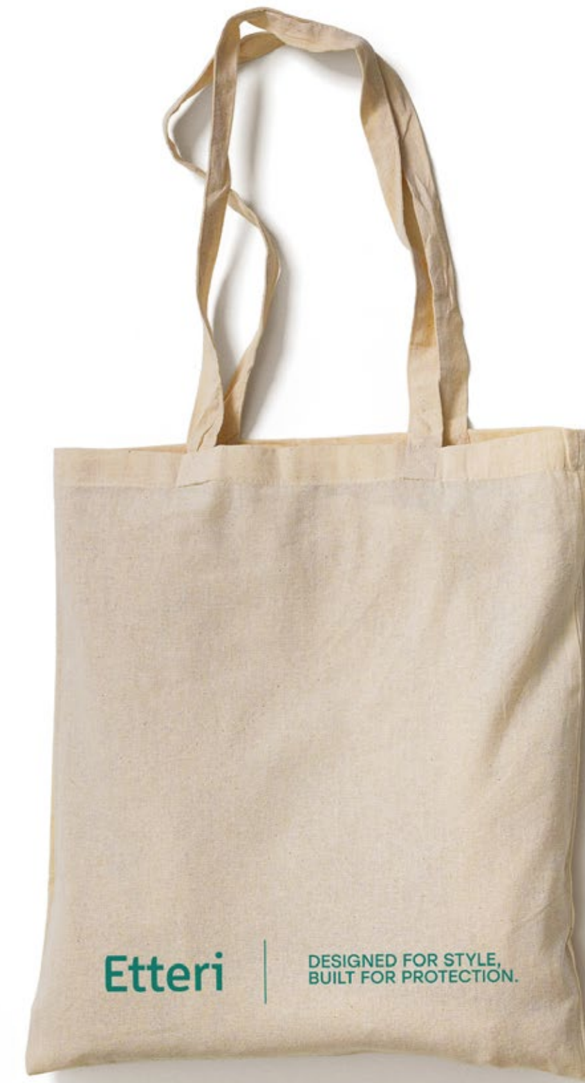
Shopping bag x1