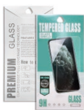
2.5D TEMPERED GLASS PREMIUM